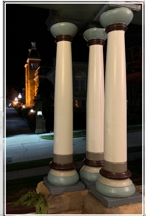
(Above) An up-close look at the new pillars on the front porch of the Admission House, which were essential for the roof's stability.

The majority of the Phase II renovation project will be completed at the start of the spring 2021 semester. There are some components that we are not able to complete until late spring or early summer due to supply chain complications during a pandemic or simply due to timing. These components include the front door installation, landscape design, and some other small details. Please feel free to stop by the Admission House to see the improvements. For now, take a look at some of our reno progress pictures. We couldn't be more pleased with the fresher and current look of the exterior of the W&J Admission House. We know our prospective students and parents will appreciate the experience we are providing to campus visitors and hope to attract more as a result of this vital project.